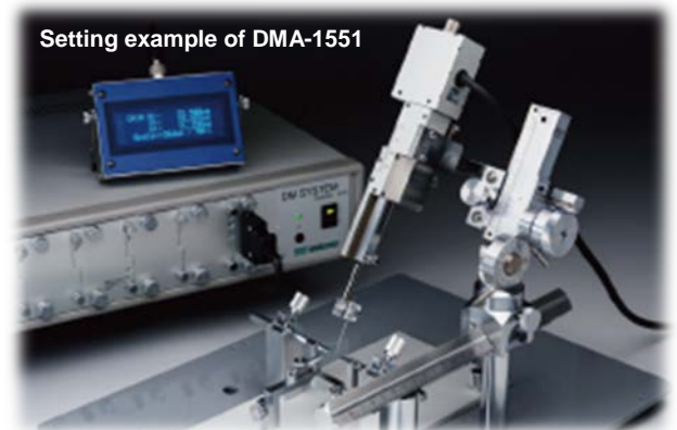
Setting example of DMA-1551

If you have any questions or need further information, please contact us.