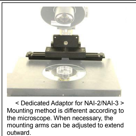
< Dedicated Adaptor for NAI-2/NAI-3 > Mounting method is different according to the microscope. When necessary, the mounting arms can be adjusted to extend outward.

Key Point of Drive Unit: NAI-2/NAI-3 series fit only its designated microscope. It is designed to minimize adjustment of drive unit at the time of installation.